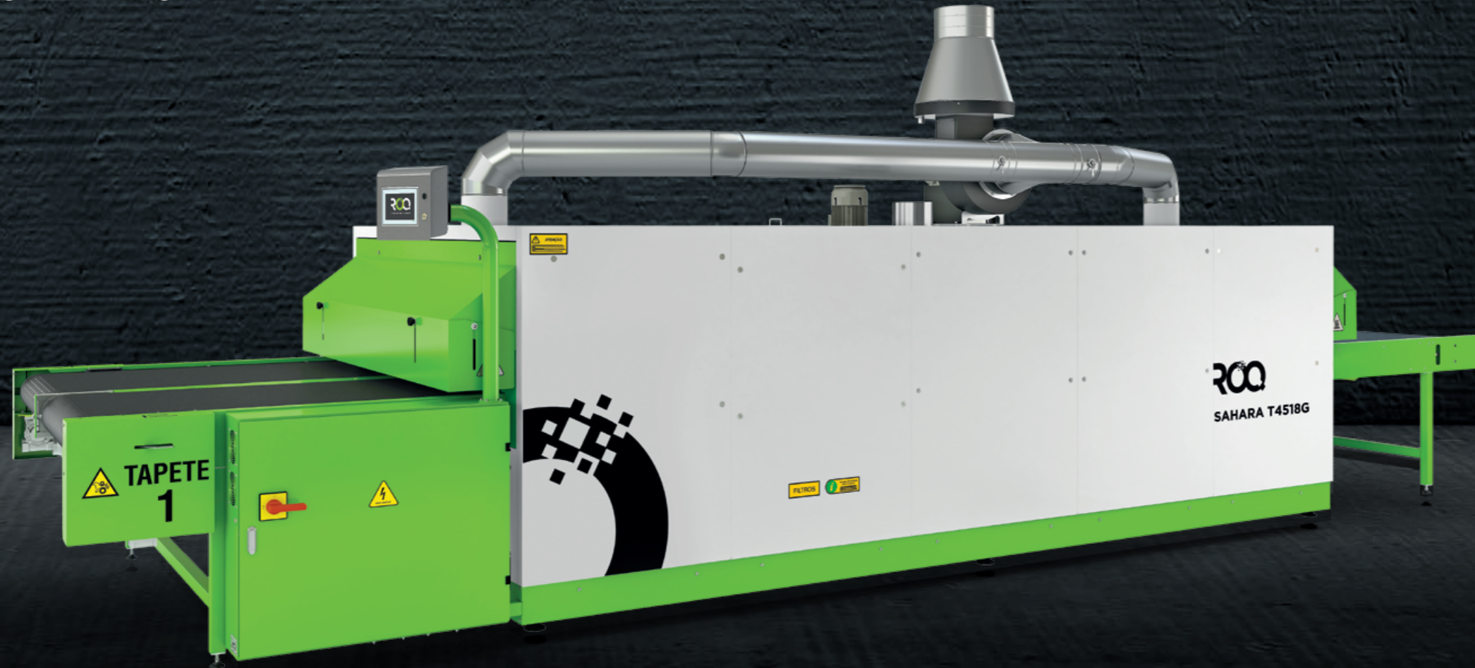
HEAT DISTRIBUTION INSIDE A ROQ SAHARA

* standard length 1500mm, other configurations under request.